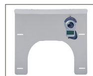
Attachment of a therapy table