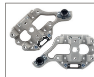
brackets for the wheelchair