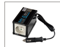
voltage converter for the car