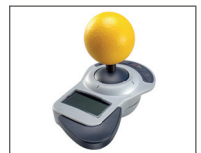
Accessories for the control unit